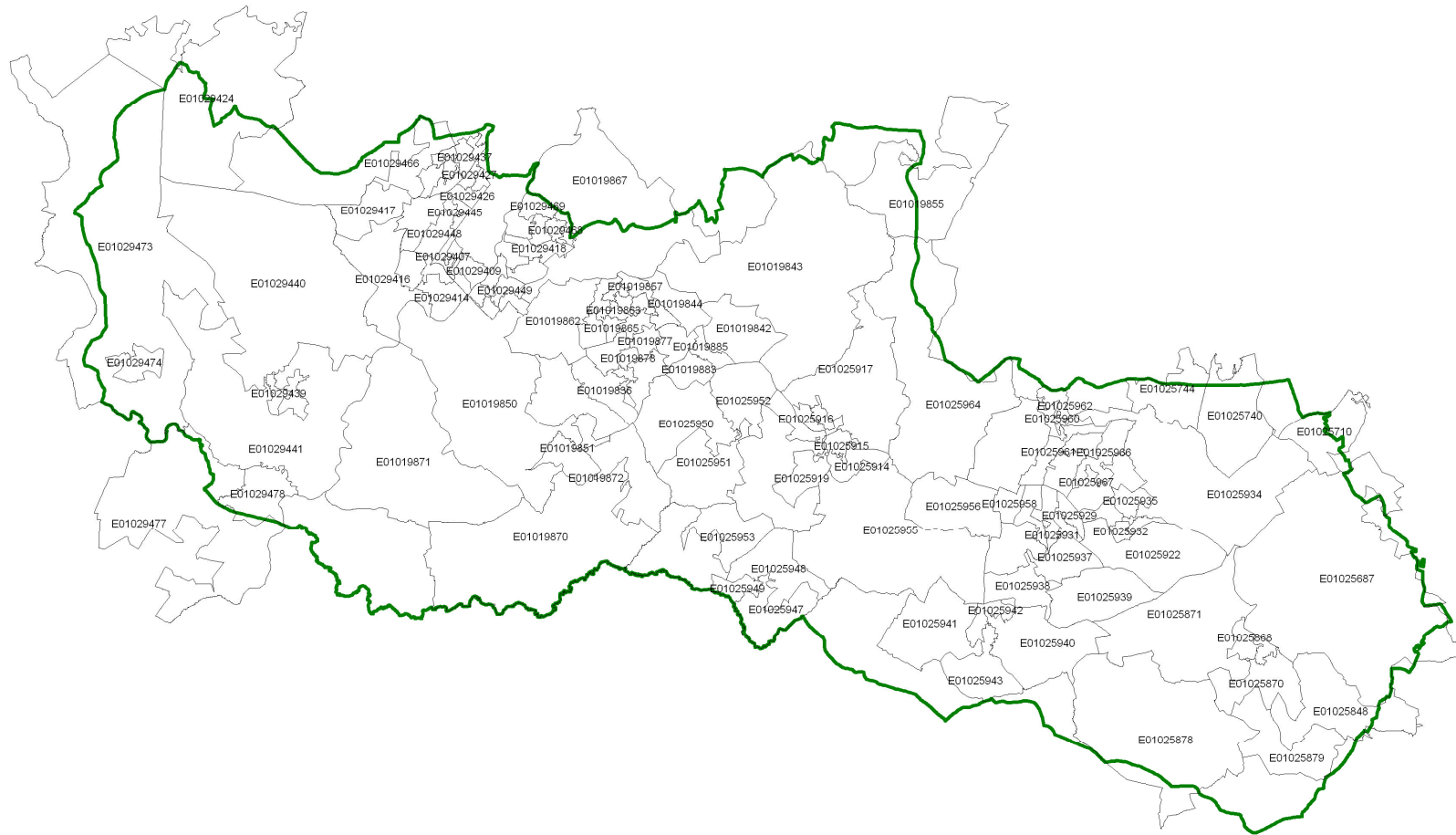
Figure A2.1: LSOA Definition of The National Forest